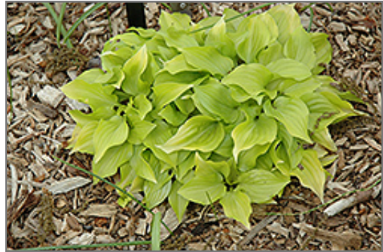
Shiny Penny Hosta