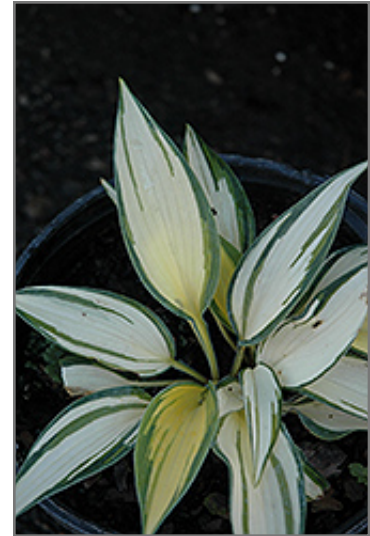
Remember Me Hosta foliage