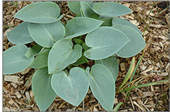
Powderpuff Hosta foliage