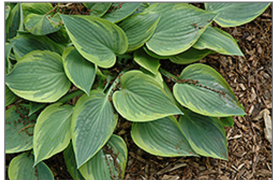
Peace Hosta foliage