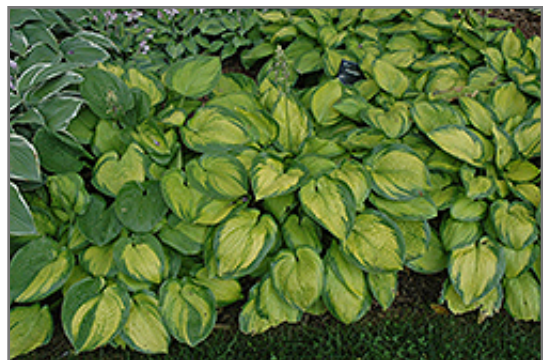
Paradigm Hosta