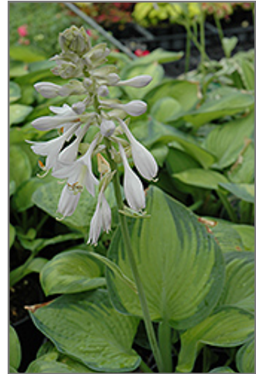
Paradigm Hosta flowers