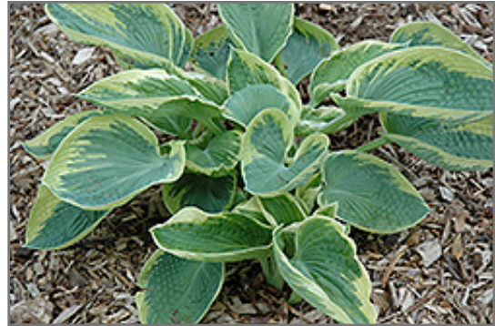
Northern Halo Hosta foliage