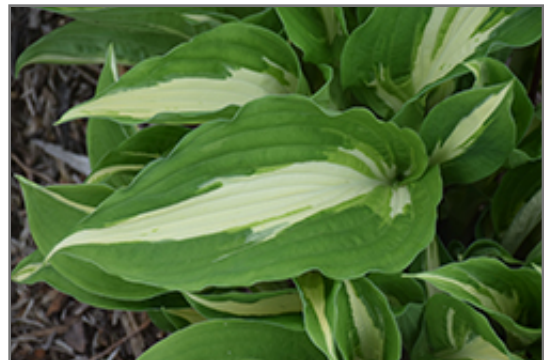
Night Before Christmas Hosta foliage