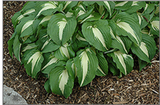
Night Before Christmas Hosta foliage

Night Before Christmas Hosta is recommended for the following landscape applications;