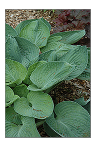
Nate The Great Hosta foliage