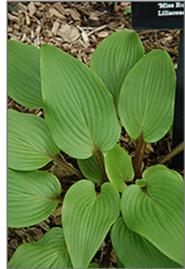
Miss Ruby Hosta foliage