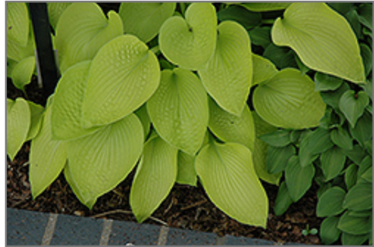
Little Aurora Hosta foliage