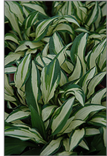
Lakeside Elfin Fire Hosta foliage

Lakeside Elfin Fire Hosta is recommended for the following landscape applications;