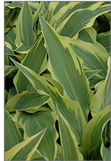
Lakeside Dragonfly Hosta foliage

Lakeside Dragonfly Hosta is recommended for the following landscape applications;