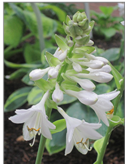
King Tut Hosta flowers