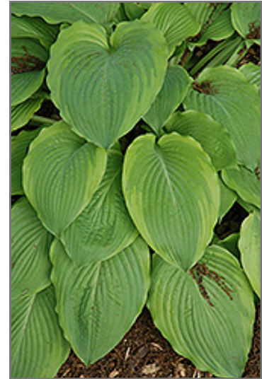
Key Lime Pie Hosta foliage