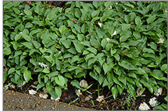
Hime Soules Hosta