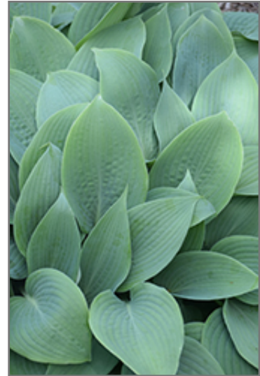
Harmony Hosta foliage