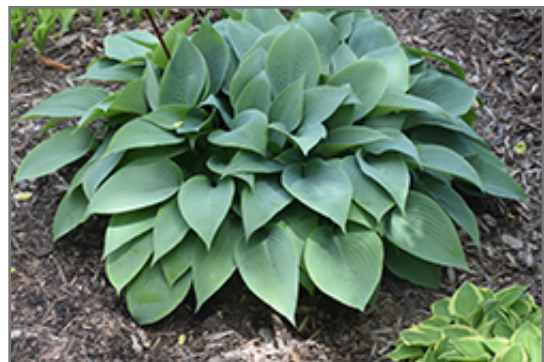
Harmony Hosta