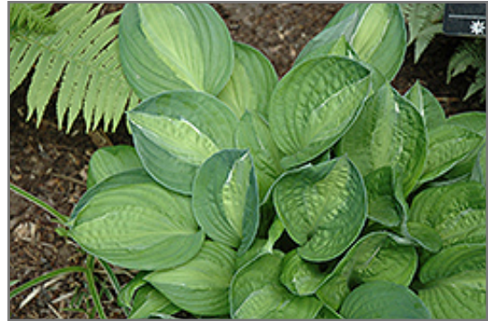
Gypsy Rose Hosta