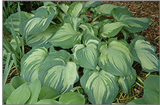
Guardian Angel Hosta