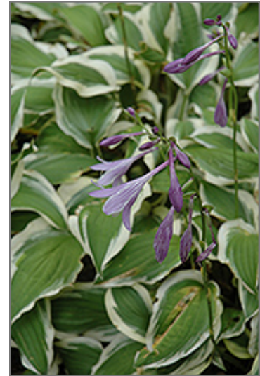
Ground Master Hosta flowers