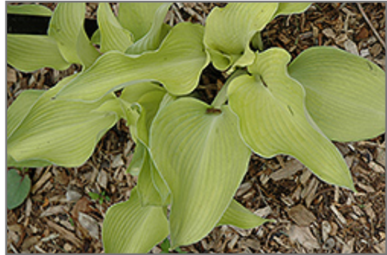
Grey Ghost Hosta foliage