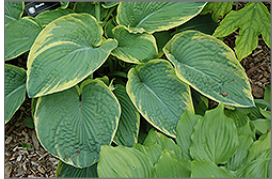
Great Arrival Hosta foliage