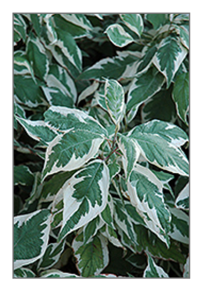
Ivory Halo Dogwood foliage