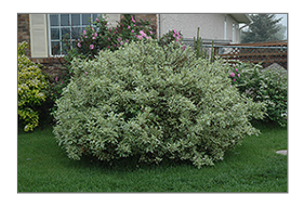
Ivory Halo Dogwood