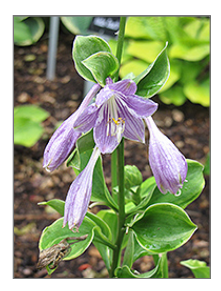
Grand Tiara Hosta flowers

Grand Tiara Hosta will grow to be about 10 inches tall at maturity extending to 18 inches tall with the flowers, with a spread of 3 feet. When grown in masses or used as a bedding plant, individual plants should be spaced approximately 30 inches apart. Its foliage tends to remain low and dense right to the ground. It grows at a medium rate, and under ideal conditions can be expected to live for approximately 10 years. As an herbaceous perennial, this plant will usually die back to the crown each winter, and will regrow from the base each spring. Be careful not to disturb the crown in late winter when it may not be readily seen!