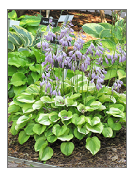
Grand Tiara Hosta in bloom

This is a relatively low maintenance plant, and is best cleaned up in early spring before it resumes active growth for the season. Gardeners should be aware of the following characteristic(s) that may warrant special consideration;