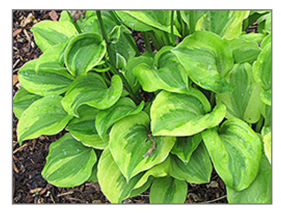
Grand Tiara Hosta foliage