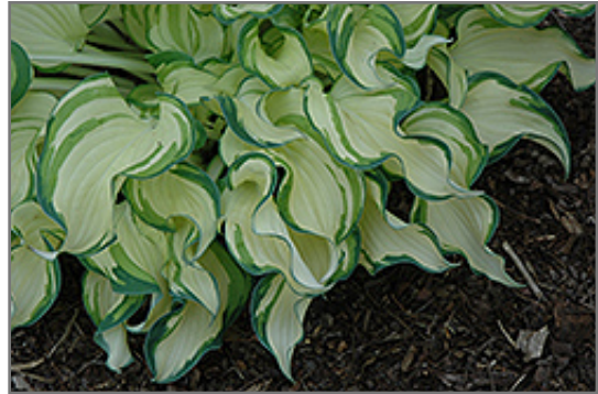
Ghost Spirit Hosta foliage