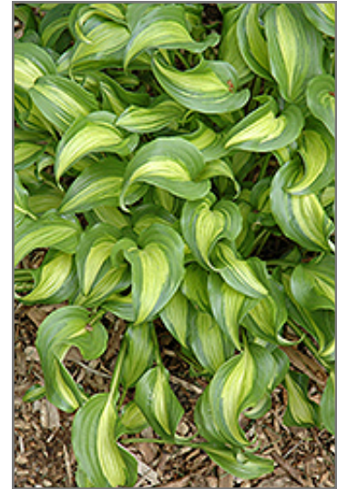
Geisha Hosta foliage