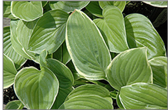
Frozen Margarita Hosta foliage

Frozen Margarita Hosta is recommended for the following landscape applications;