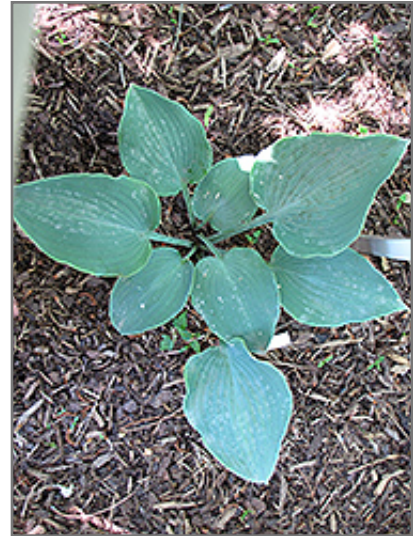
Flemish Sky Hosta