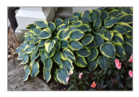
First Frost Hosta

First Frost Hosta will grow to be about 10 inches tall at maturity extending to 18 inches tall with the flowers, with a spread of 3 feet. When grown in masses or used as a bedding plant, individual plants should be spaced approximately 30 inches apart. Its foliage tends to remain low and dense right to the ground. It grows at a medium rate, and under ideal conditions can be expected to live for approximately 10 years. As an herbaceous perennial, this plant will usually die back to the crown each winter, and will regrow from the base each spring. Be careful not to disturb the crown in late winter when it may not be readily seen!