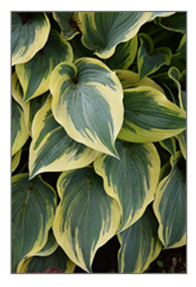
First Frost Hosta foliage

This is a relatively low maintenance plant, and is best cleaned up in early spring before it resumes active growth for the season. Gardeners should be aware of the following characteristic(s) that may warrant special consideration;