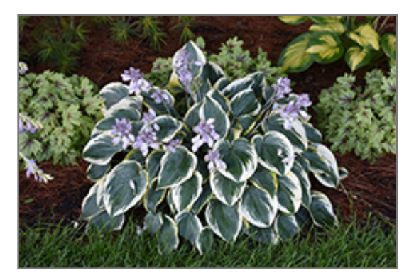
First Frost Hosta in bloom