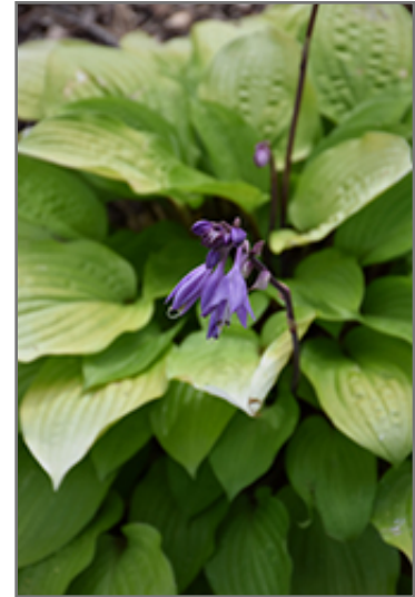
Fire Island Hosta flowers

This plant does best in partial shade to shade. It prefers to grow in average to moist conditions, and shouldn't be allowed to dry out. It is not particular as to soil type or pH. It is somewhat tolerant of urban pollution. This particular variety is an interspecific hybrid. It can be propagated by division; however, as a cultivated variety, be aware that it may be subject to certain restrictions or prohibitions on propagation.