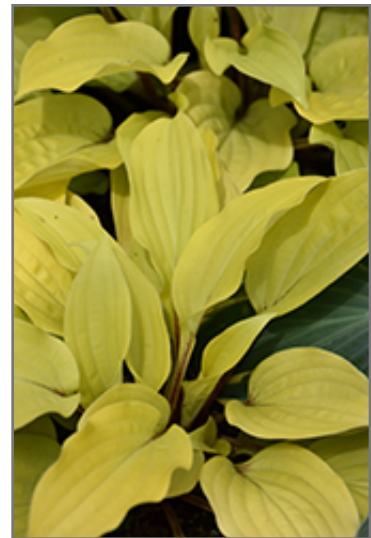
Fire Island Hosta foliage