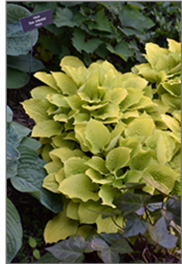
Fire Island Hosta

Fire Island Hosta is recommended for the following landscape applications;