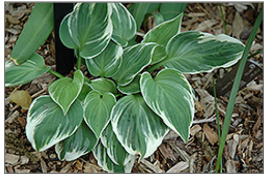
Fair Maiden Hosta foliage