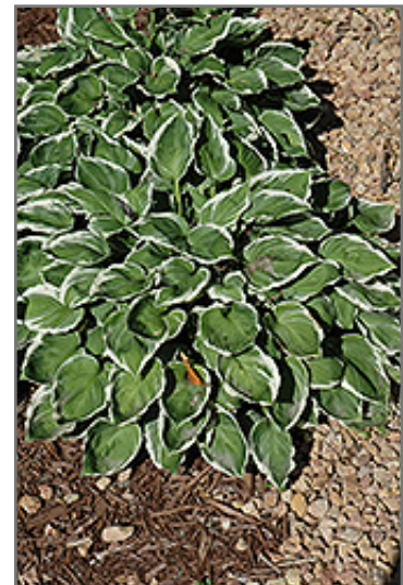
Fair Maiden Hosta