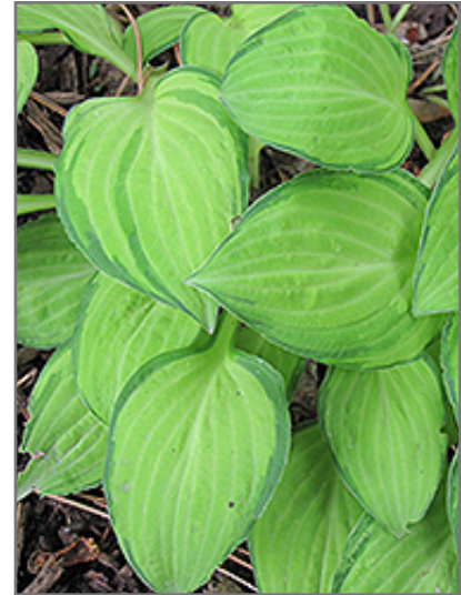
Emerald Tiara Hosta foliage

Emerald Tiara Hosta is recommended for the following landscape applications;