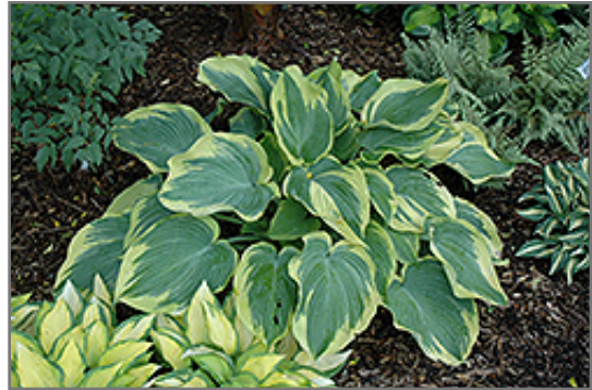
Earth Angel Hosta