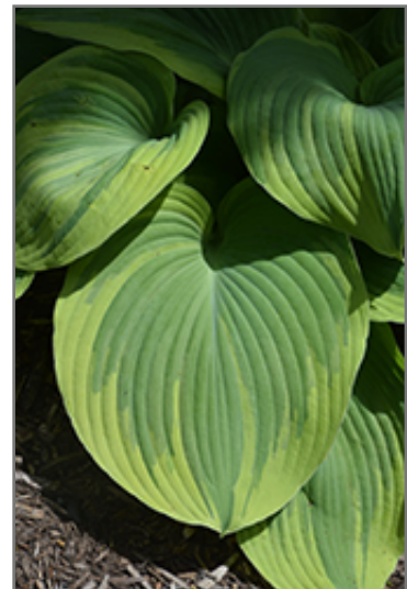
Earth Angel Hosta foliage