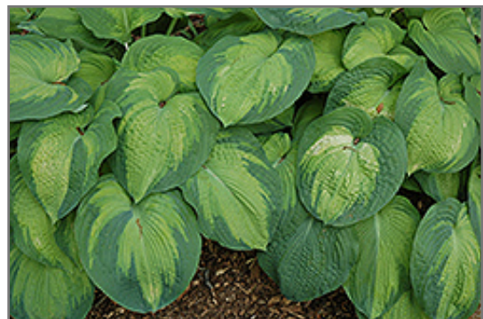
Color Glory Hosta foliage