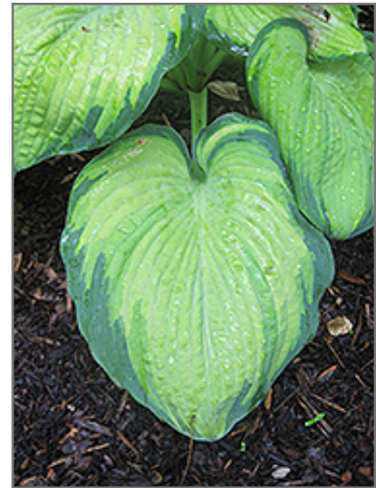
Color Glory Hosta foliage

Color Glory Hosta is recommended for the following landscape applications;