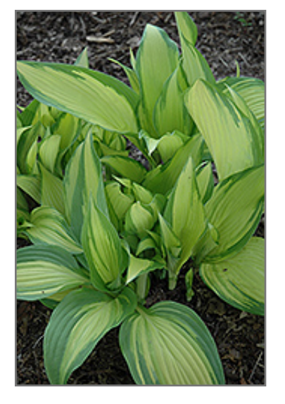
Choko Nishiki Hosta foliage

A slow growing, medium sized variety perfect for shaded borders, beds and containers; features mounds of thick, lightly corrugated medium green foliage with golden yellow centers; pale lavender flowers appear in mid summer; low maintenance