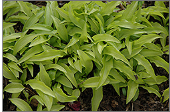
Chartreuse Wiggles Hosta foliage