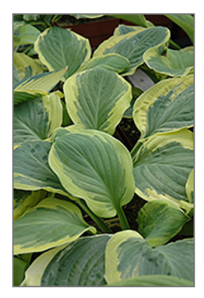
Carnival Hosta foliage