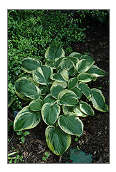
Carnival Hosta

Carnival Hosta is recommended for the following landscape applications;