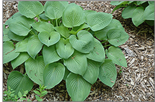
Candy Hearts Hosta