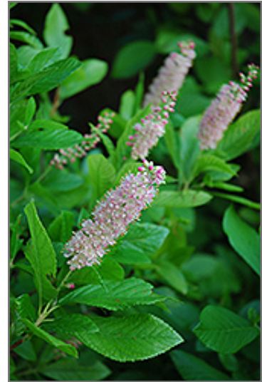
Pink Spires Summersweet flowers