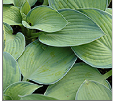
Bright Lights Hosta foliage

A vigorous variety featuring dense mounds of thick, heavily puckered, heart shaped leaves, emerges gold and matures to chartreuse with blue margins; white bell shaped flowers emerge during the mid summer; adds color and texture to beds and borders