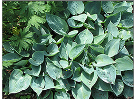
Blue Moon Hosta