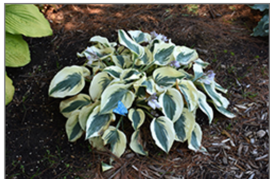
Blue Ivory Hosta