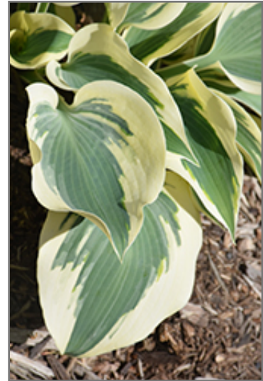
Blue Ivory Hosta foliage

This is a relatively low maintenance plant, and is best cleaned up in early spring before it resumes active growth for the season. Gardeners should be aware of the following characteristic(s) that may warrant special consideration;