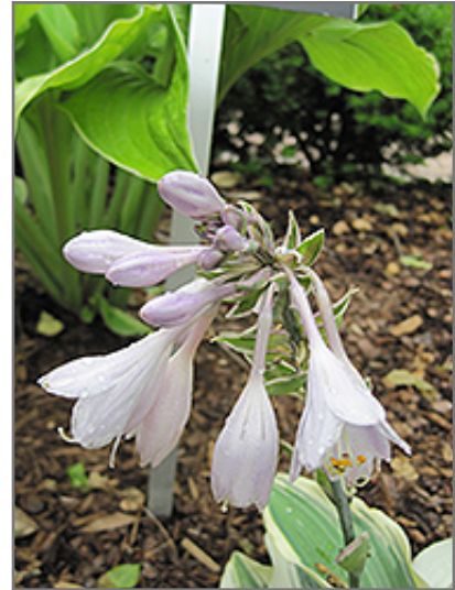
Blue Ivory Hosta flowers

This plant does best in partial shade to shade. It prefers to grow in average to moist conditions, and shouldn't be allowed to dry out. It is not particular as to soil type or pH. It is somewhat tolerant of urban pollution. This particular variety is an interspecific hybrid. It can be propagated by division; however, as a cultivated variety, be aware that it may be subject to certain restrictions or prohibitions on propagation.