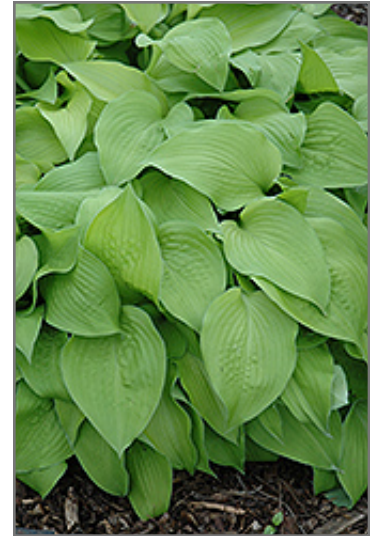
Blonde Elf Hosta foliage