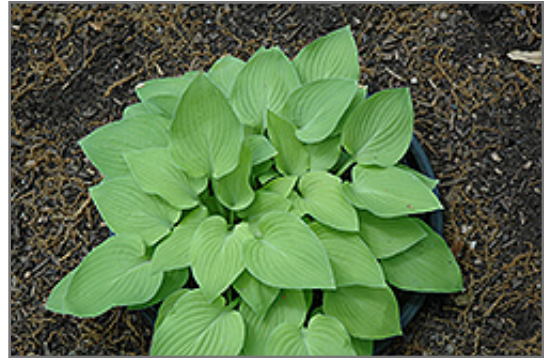
Birchwood Parky's Gold Hosta