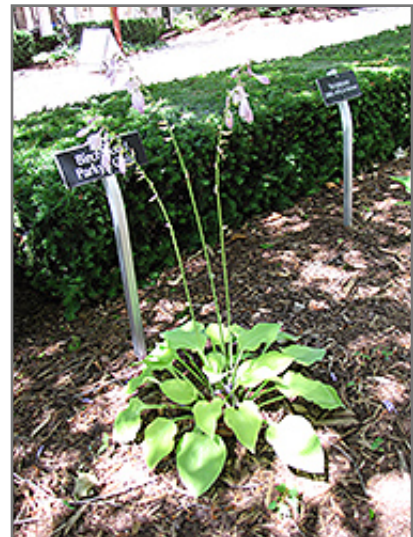
Birchwood Parky's Gold Hosta in bloom