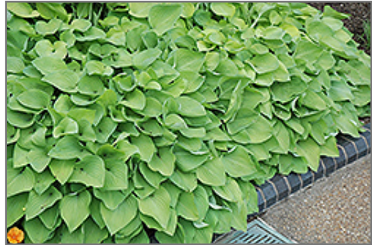
Birchwood Parky's Gold Hosta

This plant does best in partial shade to shade. It prefers to grow in average to moist conditions, and shouldn't be allowed to dry out. It is not particular as to soil type or pH. It is somewhat tolerant of urban pollution. This particular variety is an interspecific hybrid. It can be propagated by division; however, as a cultivated variety, be aware that it may be subject to certain restrictions or prohibitions on propagation.