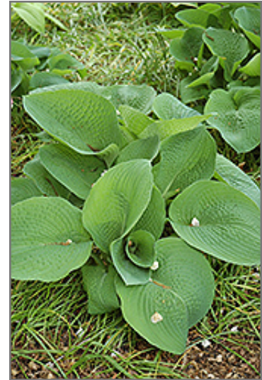
Big Mama Hosta foliage