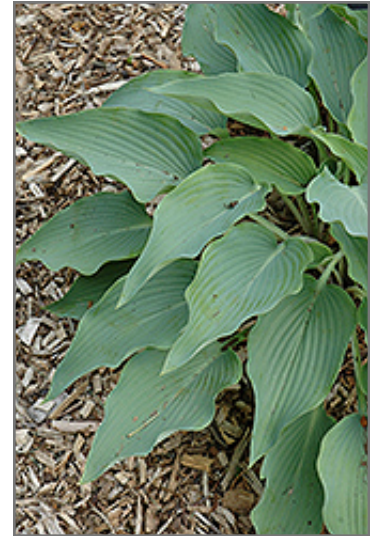
Barbara May Hosta foliage