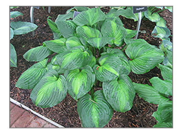
Avocado Hosta

This is a relatively low maintenance plant, and is best cleaned up in early spring before it resumes active growth for the season. Gardeners should be aware of the following characteristic(s) that may warrant special consideration;