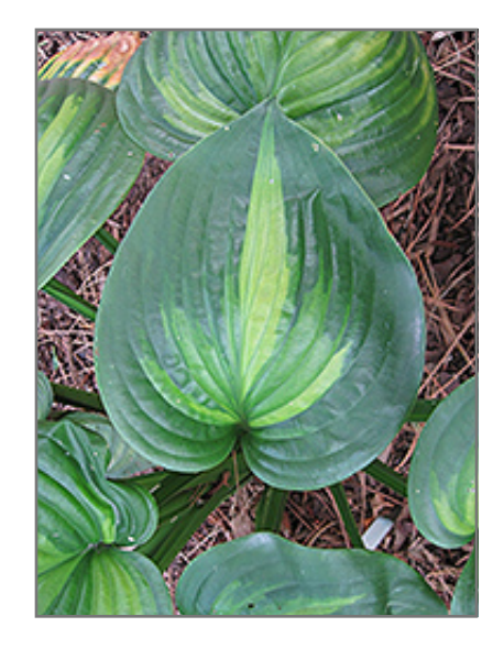
Avocado Hosta foliage