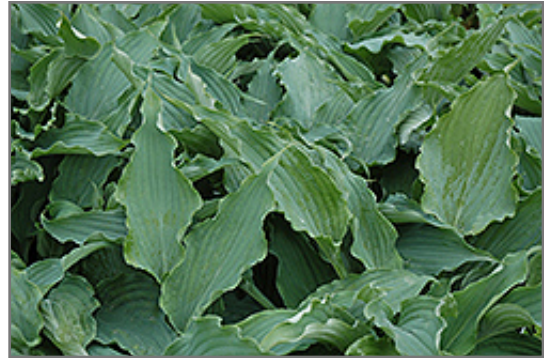
Arctic Blast Hosta foliage