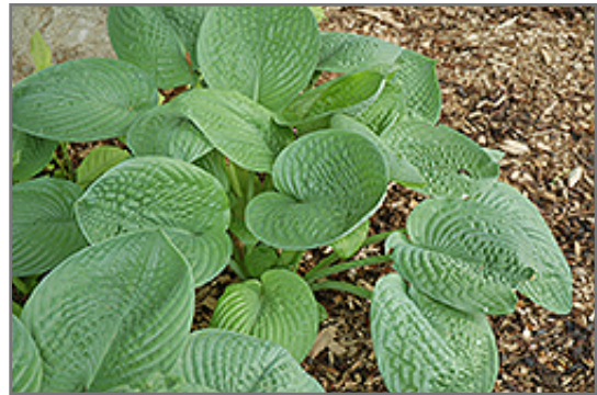
Aqua Velva Hosta foliage