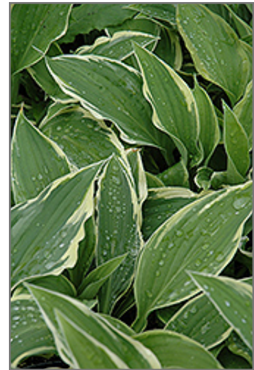
Antioch Hosta foliage

Ornamental corrugated leaves are medium-green with a creamy margins; provides beautiful texture and contrast to other plants; pale lavender spikes of flowers in early to mid-summer