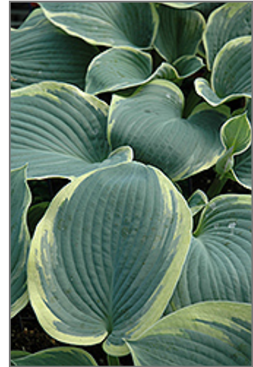
American Halo Hosta foliage

American Halo Hosta is recommended for the following landscape applications;