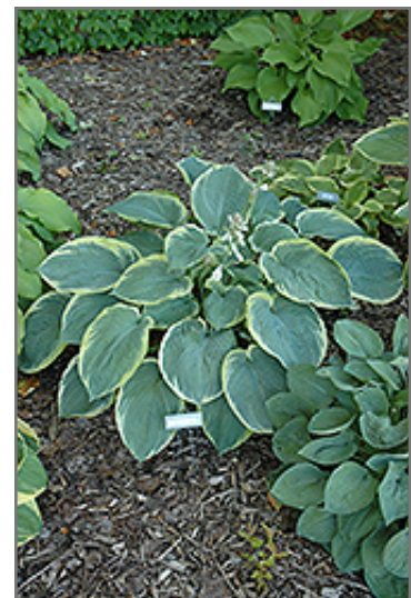
American Halo Hosta